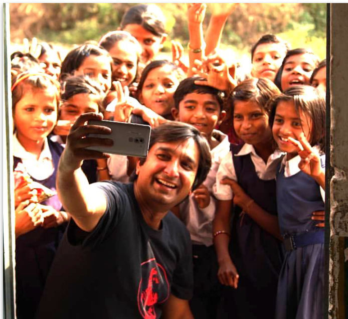
Amitabh with his kids sharing moments pristine joy